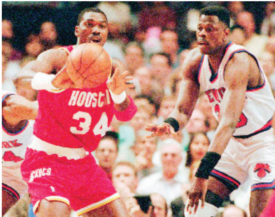
Houston Rockets center Hakeem Olajuwon and New York Knicks center Patrick Ewing in the NBA finals in 1994.

1969-70 - team moved to North Carolina to become the Cougars