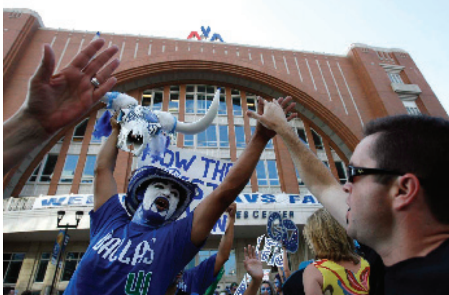
Dallas fans celebrate outside the American Airlines Center before Game 1 of the NBA finals in 2006.