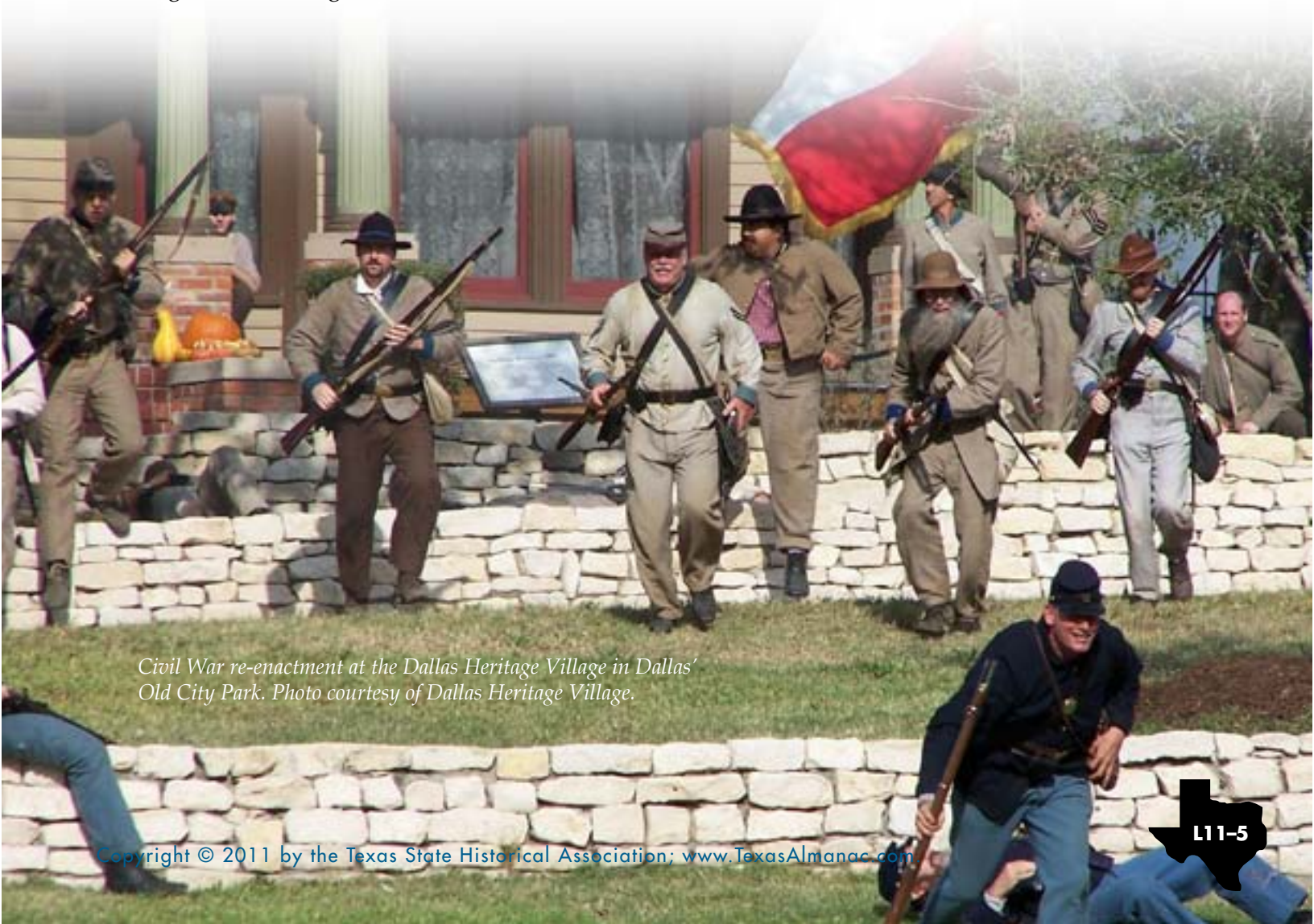
Civil War re-enactment at the Dallas Heritage Village in Dallas' Old City Park.