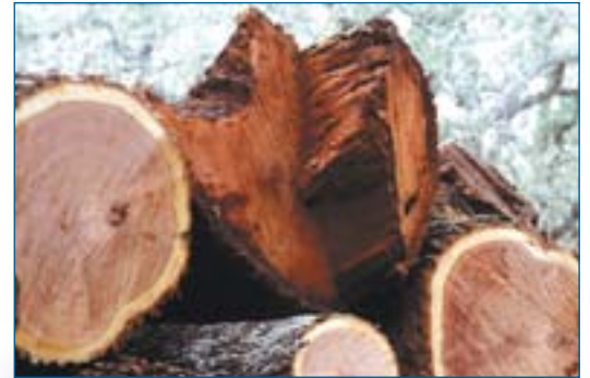
These mesquite logs show the beautiful heartwood.