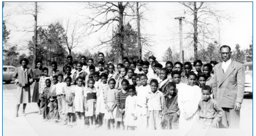
(pictured above) Students and teachers of Washington School (a three-teacher Rosenwald school) at Center Point in Nacogdoches County gathered for a group photo during the 1951–1952 school year.

A teacher, center, and his students stand in front of the Sandy Grove School during the 1923–1924 school year. Located in Burleson County, this school is an example of a one-room, one-teacher Rosenwald design.