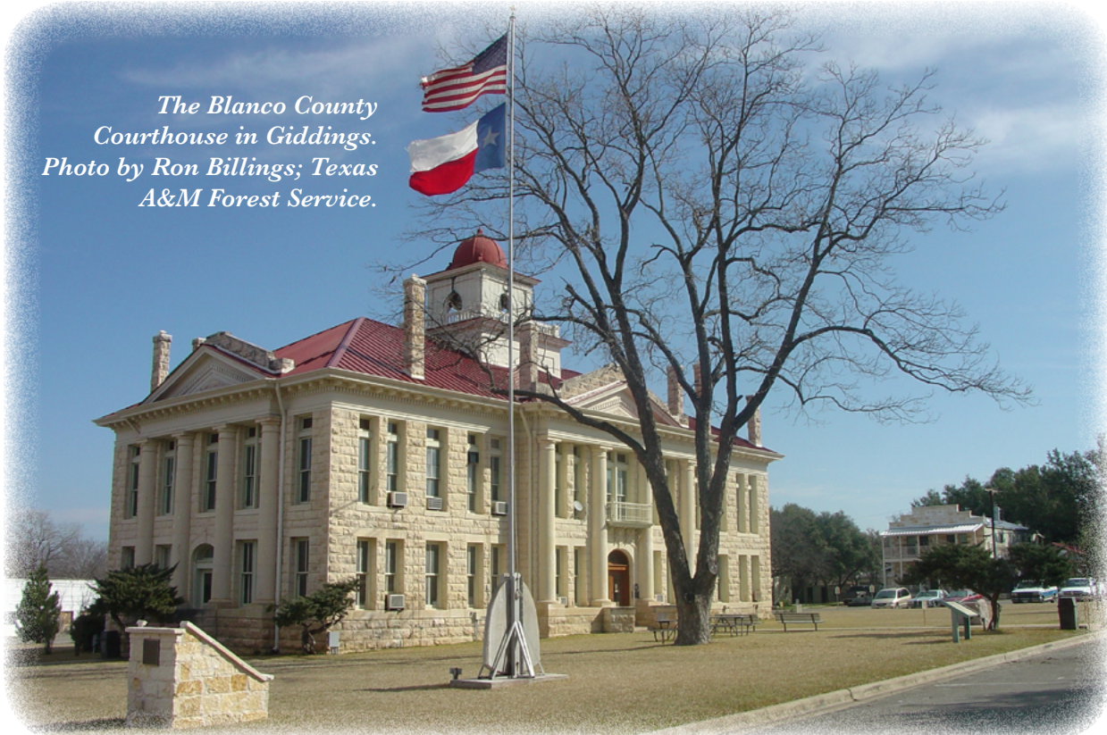
The Blanco County Courthouse in Giddings.