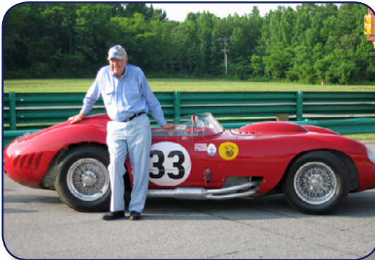
Race car driver and designer Carroll Shelby stands by the Maserati 450S he raced in 1957. Born in Leesburg, he designed the Cobra and was the second American to win the Le Mans.