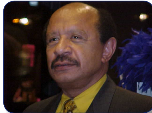
Sherman Hemsley starred in the hit television show “The Jeffersons” for over a decade, 1975–1985, and he lived in El Paso on and off for more than 10 years.