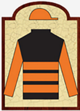
SIR BARTON 1919