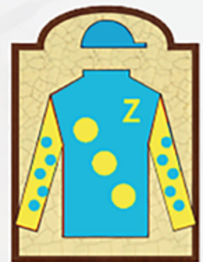
AMERICAN PHAROAH 2015

Illustration courtesy of Belmont Stakes.