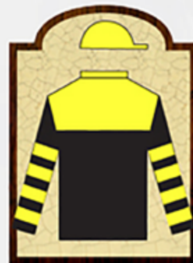
SEATTLE SLEW 1977