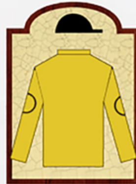
COUNT FLEET 1943