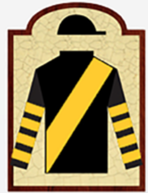
WAR ADMIRAL 1937