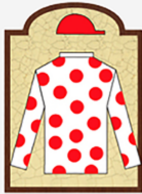
GALLANT FOX 1930